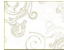
swirl plush | 5A128