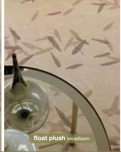
float plush broadloom