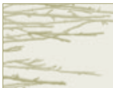
shadow plush | 5A127