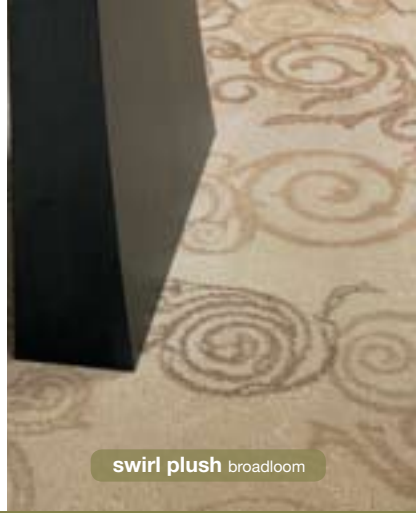
swirl plush broadloom