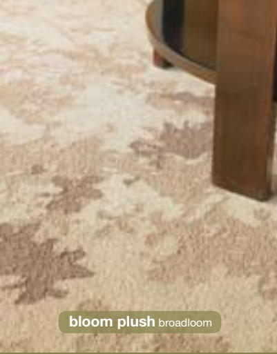
bloom plush broadloom